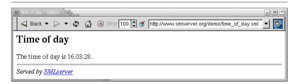
Fig. 1. The result of requesting the script time_of_day.sml.

The result of a user requesting the file time_of_day.sml from the Web server is shown in Fig. 1. The script uses the function Ns.Conn.return to send an HTTP response with HTTP status code 200 (Page found) and MIME type text/html to the browser along with HTML code passed in the argument string.