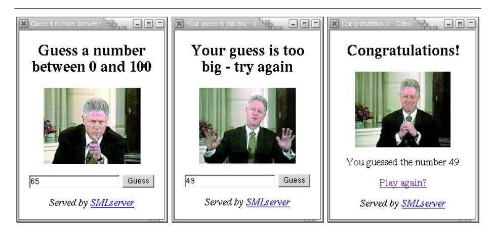
Fig. 2. Three different pages served by the "Guess a Number" game.

Notice that the game uses the HTTP request method POST, so that the random number that the user is to guess is not shown in the browser's location field. It is left as an exercise to the reader to find out how—with some help from the Web browser—it is possible to "guess" the number using only one guess. Figure 2 shows three different pages served by the "Guess a Number" game.